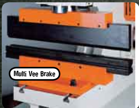
Multi Vee Brake