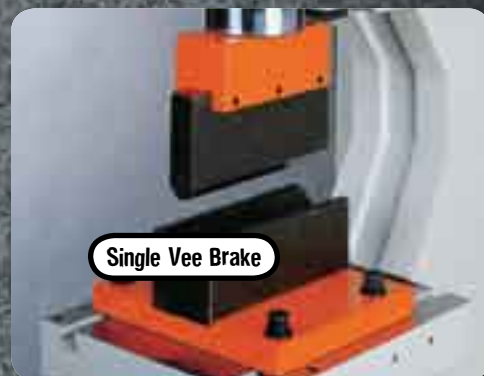
Single Vee Brake

Please call your Baileigh Industrial sales representative at +44 (0)24 7661 9267 for more information.