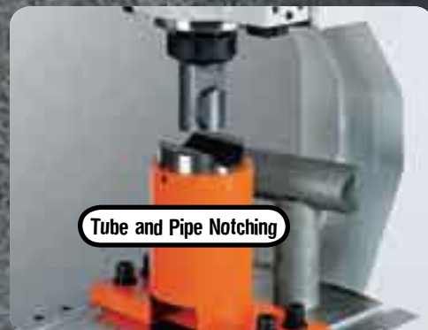
Tube and Pipe Notching