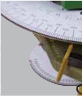
Autostop optional programmer